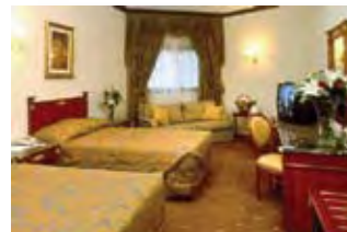
Movenpick Anwar Al Madina