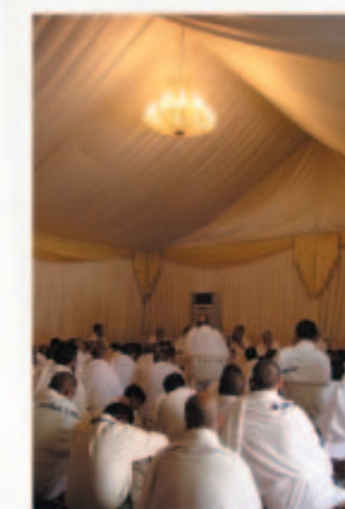
AIR-CONDITIONED VIP TENTS

Departure from Arafat is faster because of its location on the curb hence saving approx. 2 hours in journey at the time of exiting Arafat for Muzdalifa. An advantage you can have only with Universal Express.