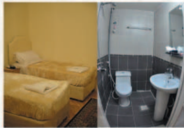
TENTS WITH ATTACH BATHROOM

We can arrange VIP Transportation GMC / Land Cruiser M 2004 - 2008 for five days of Hajj from 08 to 12 zul Hijja for Mashair (Mina - Arafat - Muzdalfa) for SR 20, 000 per SUV (Max 6 Person).