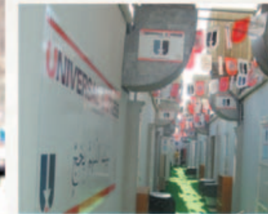
SPACIOUS MAKTAB PASSAGES