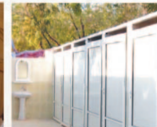
PURPOSE-BUILT BATHROOMS IN ARAFAT