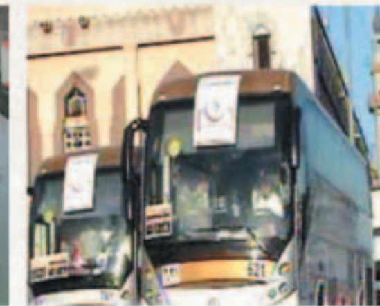
DEDICATED SHUTTLE BUSES