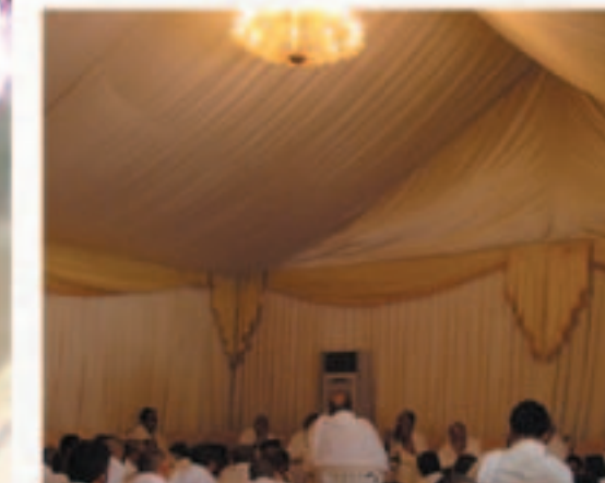
LECTURES BY RELIGIOUS SCHOLARS